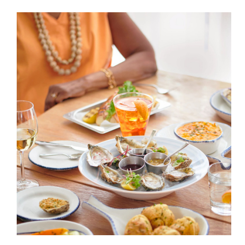
FINE & CASUAL DINING

The Utopia of the Seas is designed to be a floating destination that caters to all types of travelers, whether you're looking for adventure, relaxation, family fun, or luxury. It combines innovative features with traditional Royal Caribbean favorites, ensuring there's something for everyone to enjoy!