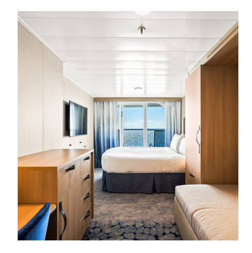
OCEAN VIEW SUITES