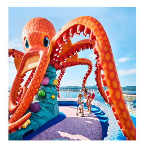
ACTIVITIES FOR ALL AGES