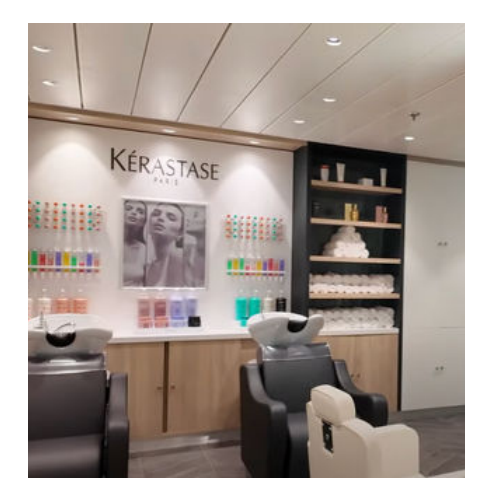
WELLNESS & SPA